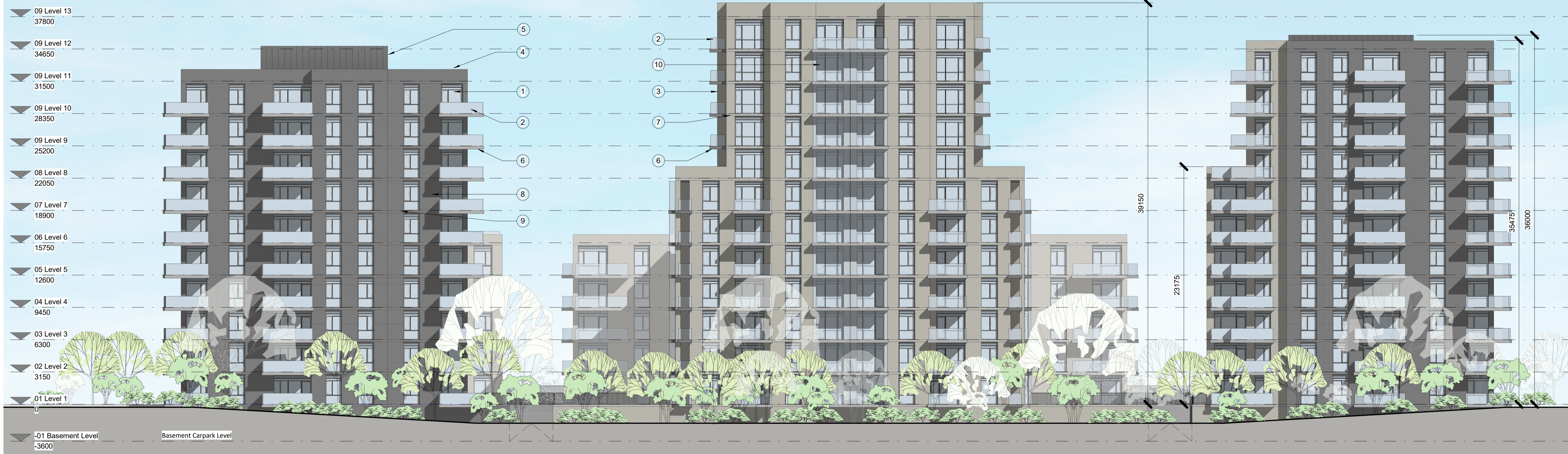
2 Sector 7 North Elevation (2) 1 : 200