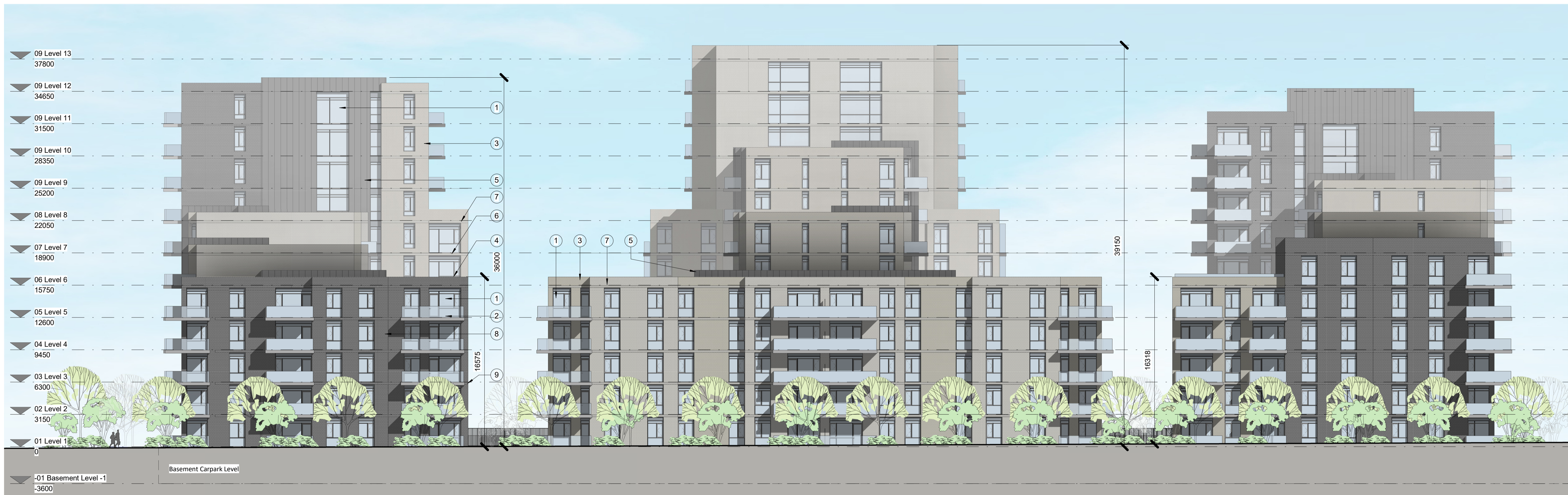
1 Sector 7 South Elevation (1) 1 : 200